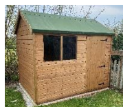
NEW SHED in Butterfly garden - Donated by Friends of Shipley School.

School Gardening club will start on occasional Fridays after school instead of the usual third Sunday of the month and will be incorporated with Friendship Fridays. More info on when will be announced on Class WhatsApp class chats.